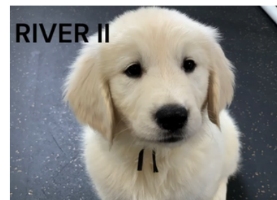
Country Goldens donated River II. Thank You to Sponsor Thompson Charitable Trust

We are proud to have been able to host a phenomenal continuing education class in partnership with UTCVM, University of Tennessee College of Veterinary Medicine.